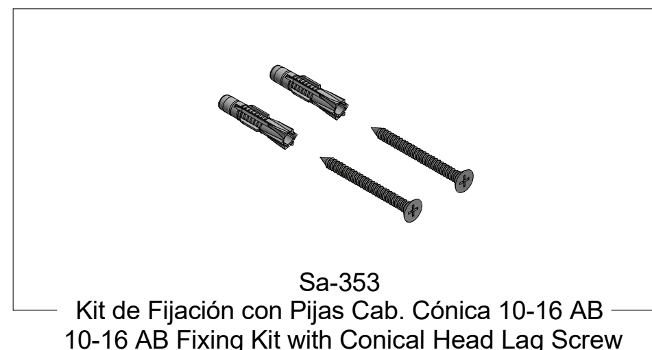
Sa-353 Kit de Fijación con Pijas Cab. Cónica 10-16 AB 10-16 AB Fixing Kit with Conical Head Lag Screw